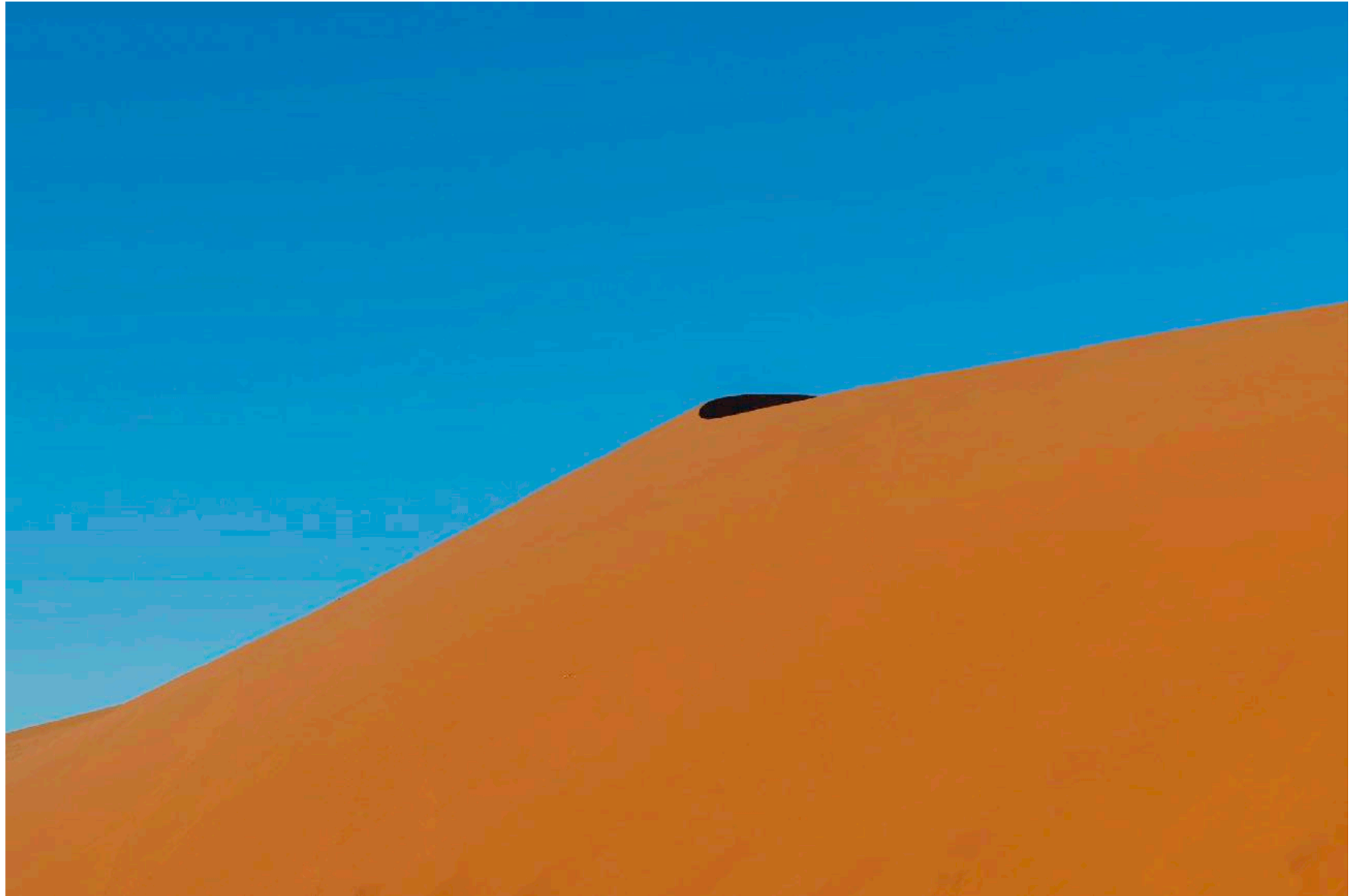
CREST OF THE WAVE